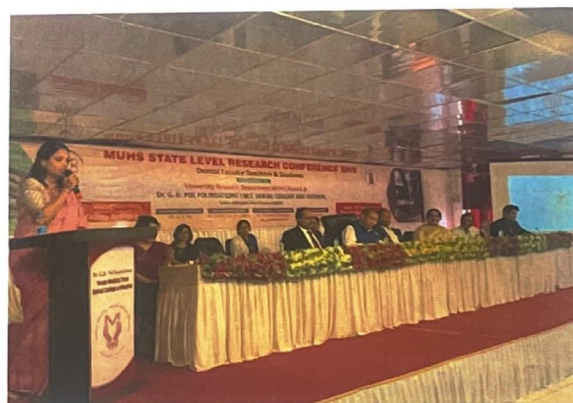
YMTDCH Director's Address