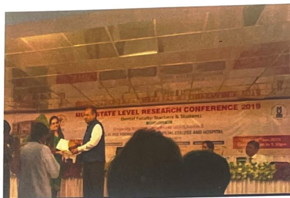
Felicitaton of the Winners