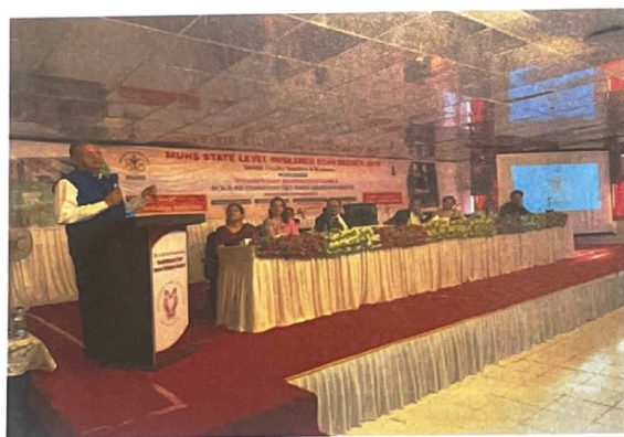
MUHS Vice Chancellor's Address